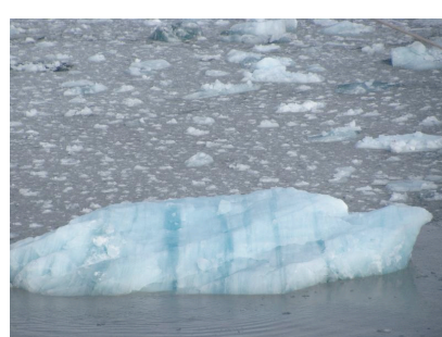
Icebergs only show 10 percent of their actual size on the surface.

Second, you cannot beat a balcony room for viewing the glacier action. The upper decks attract crowds on glacier-viewing day, and you will fight for a picture and view. If you have the benefit of the balcony, forget the crowds. A great recommendation: Go up to the Wind Jammer Café, get a hot cup of coffee, and sit on your very own deck with the most breathtaking view of the glacier right in front of you. The captain navigated our ship through the icebergs to within yards of the blue-white Hubbard Glacier where we could hear and see the awesome crack, thunder and roar of ice sheers crashing into the ocean.