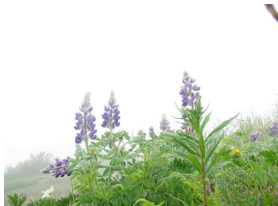
Alaskan wild flowers

We just got back from an incredible cruise on the Radiance of the Seas through the Inside Passage along the Alaska coastline. This cruise on Royal Caribbean was just outstanding — perhaps one of the most beautiful if you really enjoy natural forests, wilderness and ocean as your landscape of choice. The seven-day cruise set sail from Canada Place in Vancouver and stopped at Ketchikan, Icy Strait Point, Juneau, Hubbard Glacier, Skagway and Seward — all beautiful and all very captivating.