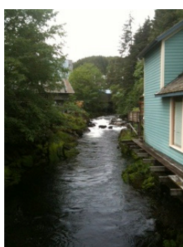
A river runs through it — Ketchikan.

Ketchikan offered numerous tours in and around the town. They also had many small boutiques and shops to browse. Ketchikan is where the world-famous totem pole tours are available. You can choose to see the totem poles by land or sea. A nice choice was the Eagle's Nest and Totem Pole tour. Take a bus about five miles outside of the town, catch a tour boat, and sit and drink coffee and keep your "eagle" eye out for the various nests — eight in total. You will not get a close-up view of the poles, so if you want to see those closer, choose a land tour. This trip was very casual and easygoing. Spotting eagles nesting offered a nice commune with nature. If you are visiting in early June make a date with a whale-watching cruise. They will not disappoint!