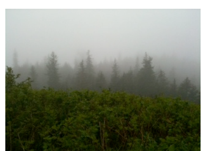
Fog-shrouded mountain top in Juneau.

First, some tips to make your trip the very best it can be. Bring a parka, even during the middle of summer. Juneau, in particular, was non-stop rain and locals said it rains almost every day until August when the showers dissipate, but hang in there. While some days were almost warm, the average temperature ranged between 40 and 60 degrees. Most people will still find 60 degrees worthy of a light sweater so don't plan on tank tops and sleeveless shirts as proper apparel. Bring a nice variety of long-sleeved shirts and a few short-sleeved T-shirts with plenty of options to build layers. Since most of the trip will involve walking or hiking, wear reliable and comfortable walking shoes. Please choose comfort over style, because nothing makes a walking trip more unbearable than blisters. This trip also required two formal evenings, and for you men, consider renting a tux instead of hauling a bulky suit. It was convenient to have the tux delivered right to your room.