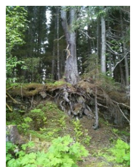
Rainforest on Ice Straits

Less notable stops Skagway and Icy Strait Point. While nice and beautiful to see the rainforest at Icy, there really wasn't much to do. These days might be half days to disembark, maybe eat lunch, and take a short hike or just shop. Then you can spend the afternoon on the ship and just keep an eye out for whales or porpoise or even an otter or two. It was definitely enjoyable to sit up in the Wind Jammer Café and keep a close eye out for sea life. In Skagway the main attraction is the White Pass Railroad, which offers a slow, but beautiful journey to the Canadian border.